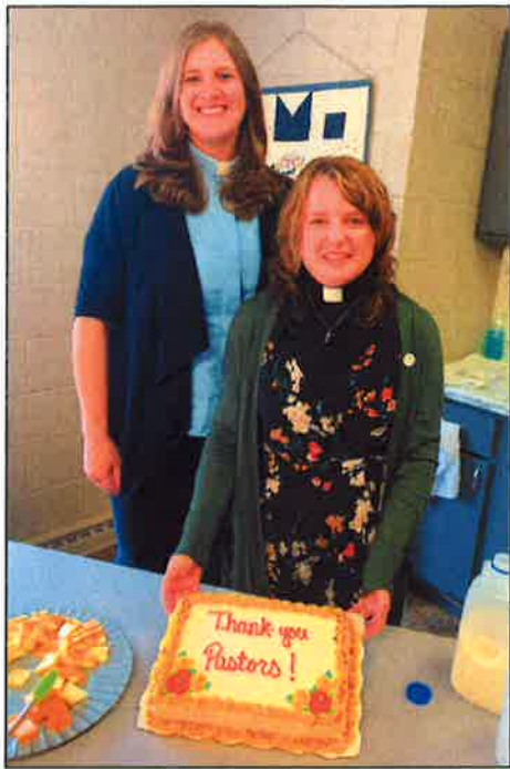
Pastors Appreciation Reception